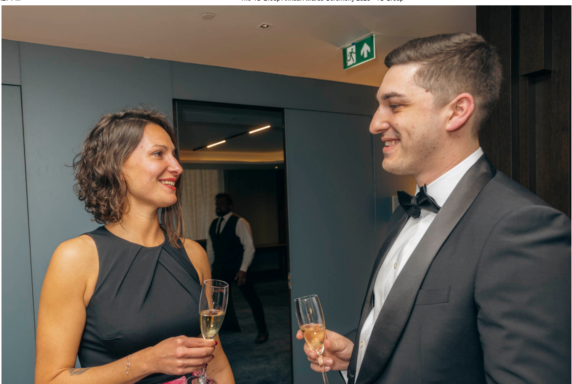
Following the pre-ceremony gathering, team members enjoyed a reception with vintage fair games, canapés and free flowing cocktails in the lead up to dinner and the awards ceremony.