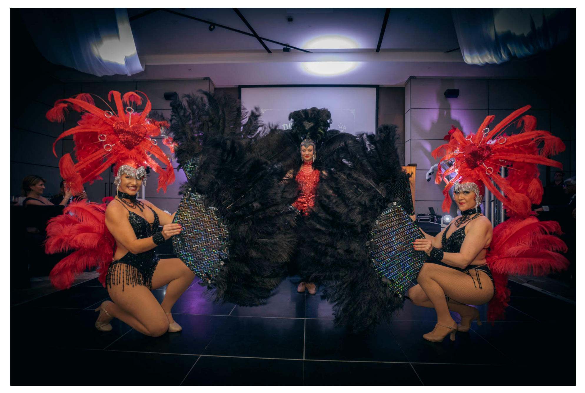
4C Group Annual Awards Ceremony 2023 - The Winners!