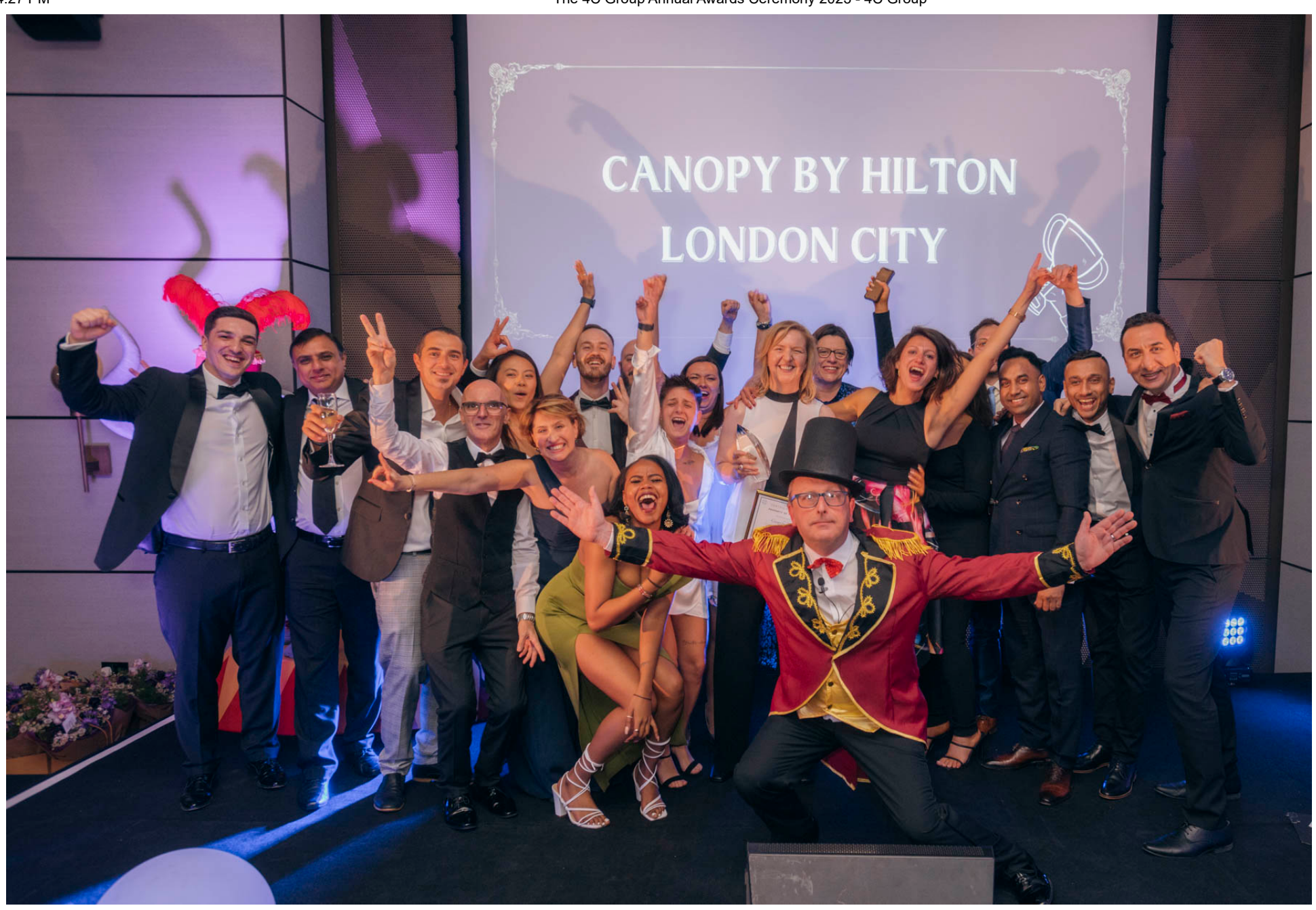
Celebrations went on well into the evening with an outstanding performance by <u>Live Entertainment UK</u> and a fabulous dance troupe who performed covers from the film, The Greatest Showman.