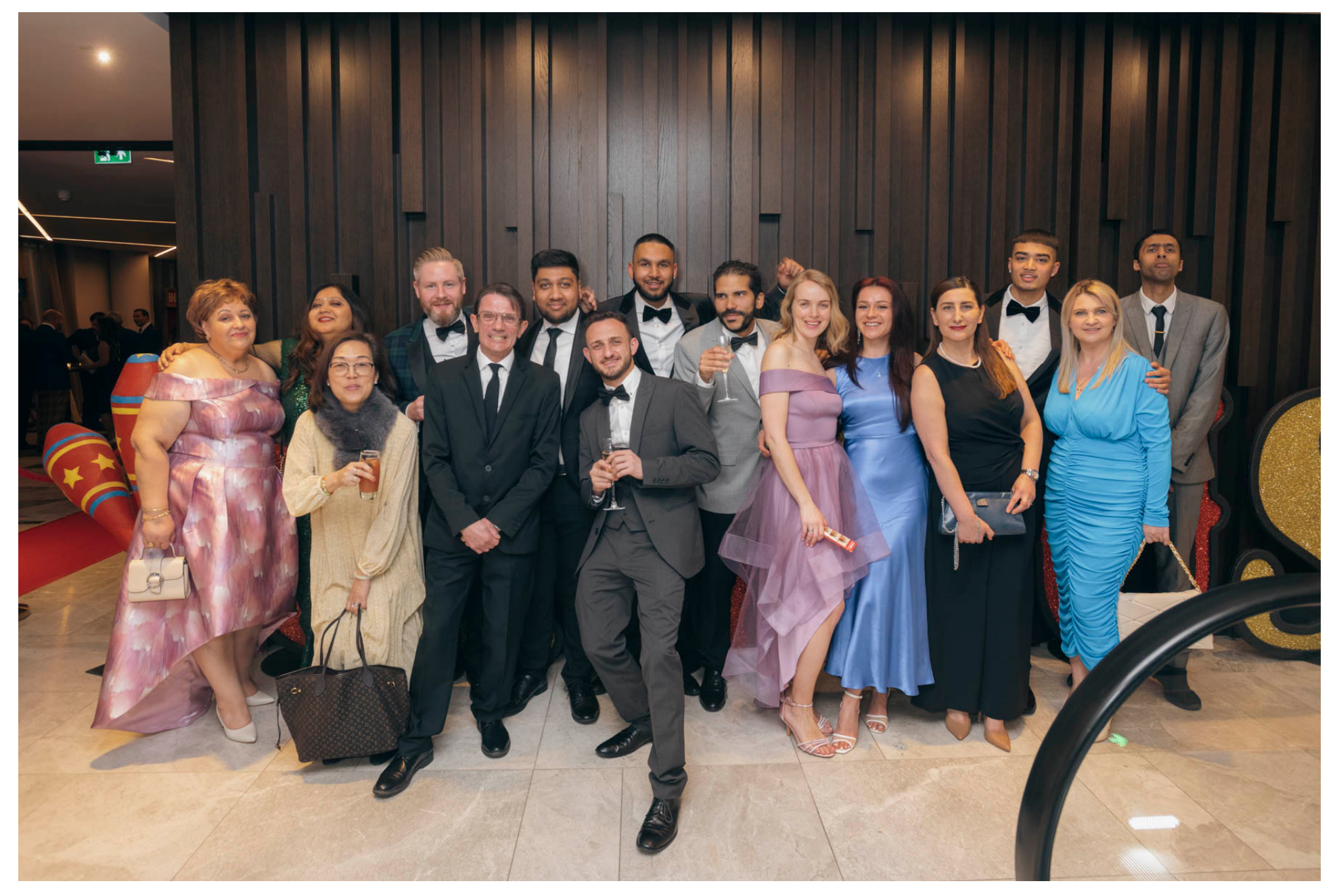
Pulling off a hat trick on the evening, <u>Canopy by Hilton London City</u> took home three group awards on the night: The ESG Excellence Award, The Quality Award and The Property of the Year Award. Many, many congratulations to their team!